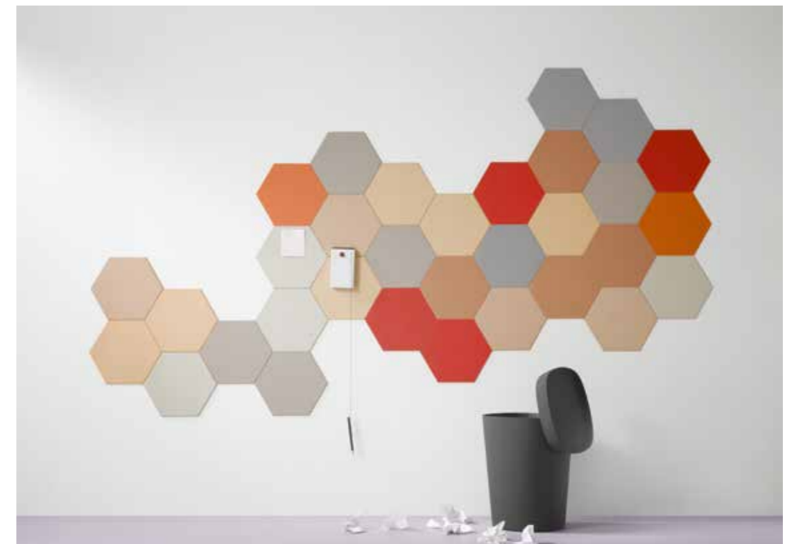
2210, 2207, 2166, 2162, 2206, 2182, 2187, 2186, 3363 | walton lilac

BULLETIN BOARD is flexible and easy to cut and handle, which allows you to create functional wall decorations with enchanting decorative effects.