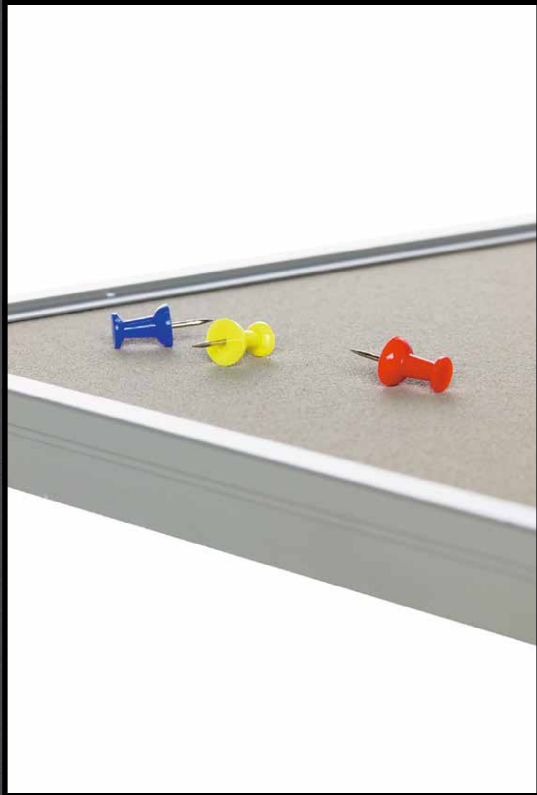
2187 | brown rice