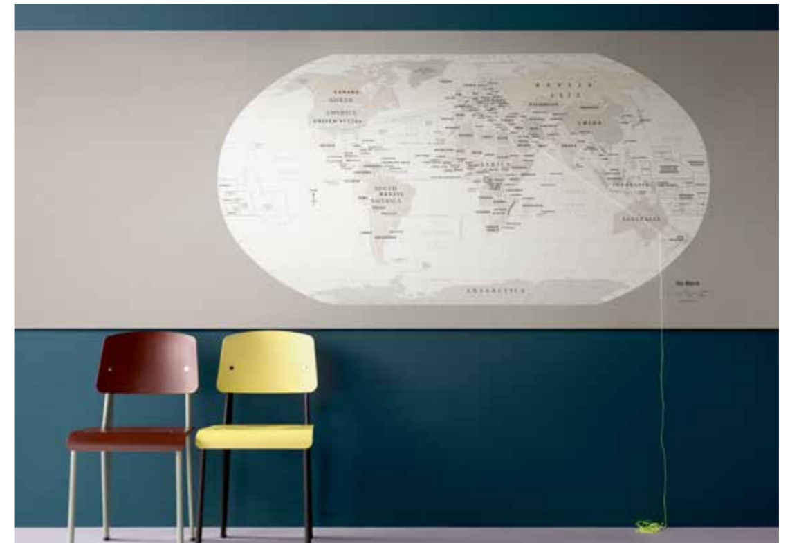
2182 | potato skin 3363 | walton lilac

BULLETIN BOARD is supplied in rolls of up to 28 metres long and 1.22 metres wide, making it suitable for large installation in for example conference rooms or alongside corridors. 3 colours are also available at 1.83m wide.