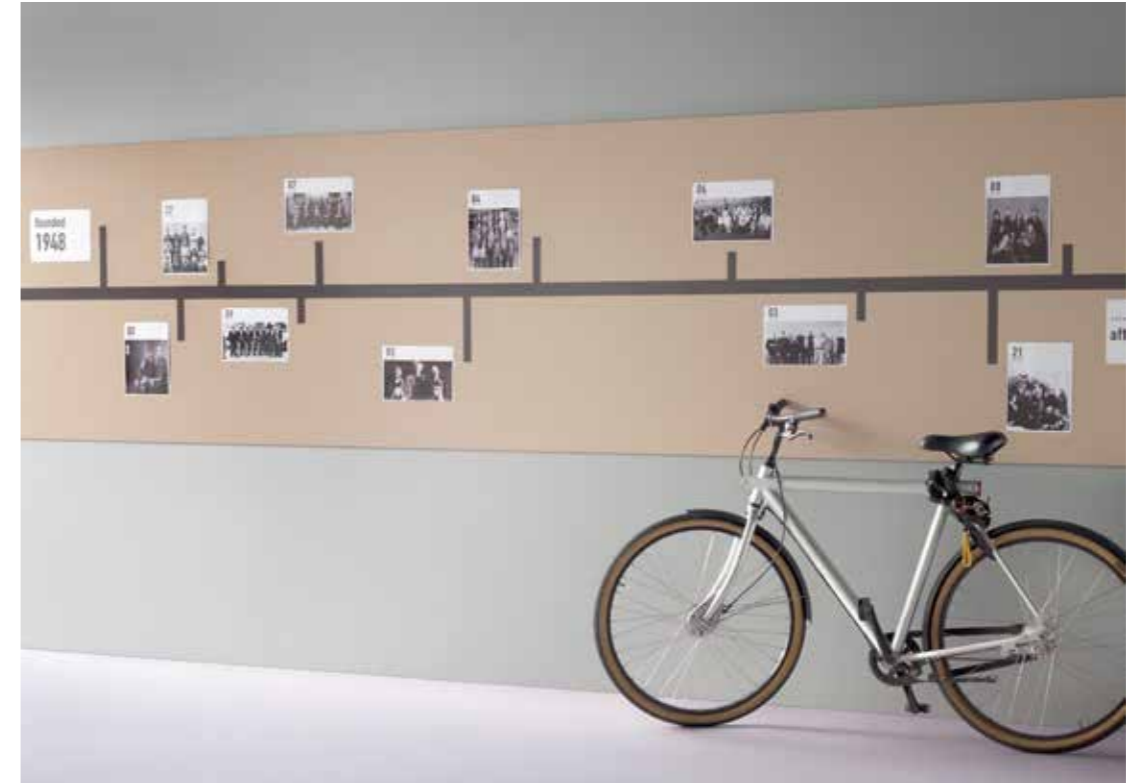
2186 | blanded almond 3363 | walton lilac