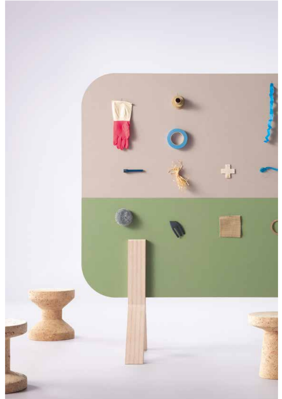
2187 | brown rice 2213 | baby lettuce 3363 | walton lilac

BULLETIN BOARD provides ideal solutions to the modern sustainable office environment where separation walls or furniture elements can double as information carriers.