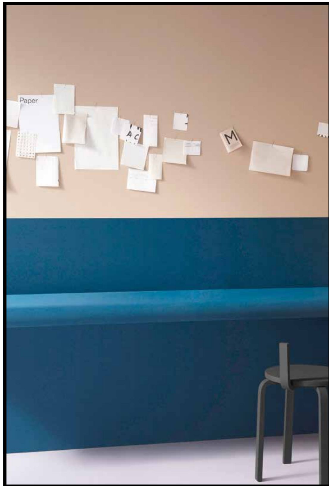
2186 | blached almond 2214 | blue berry 3363 | walton lilac