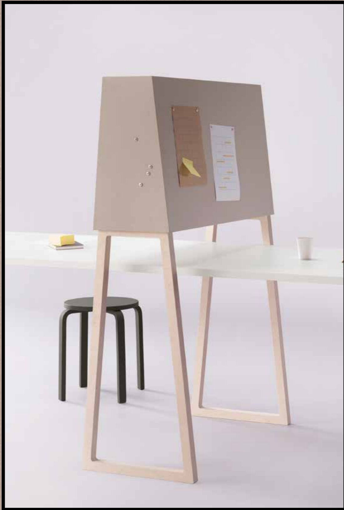
2187 | brown rice 3363 | walton lilac