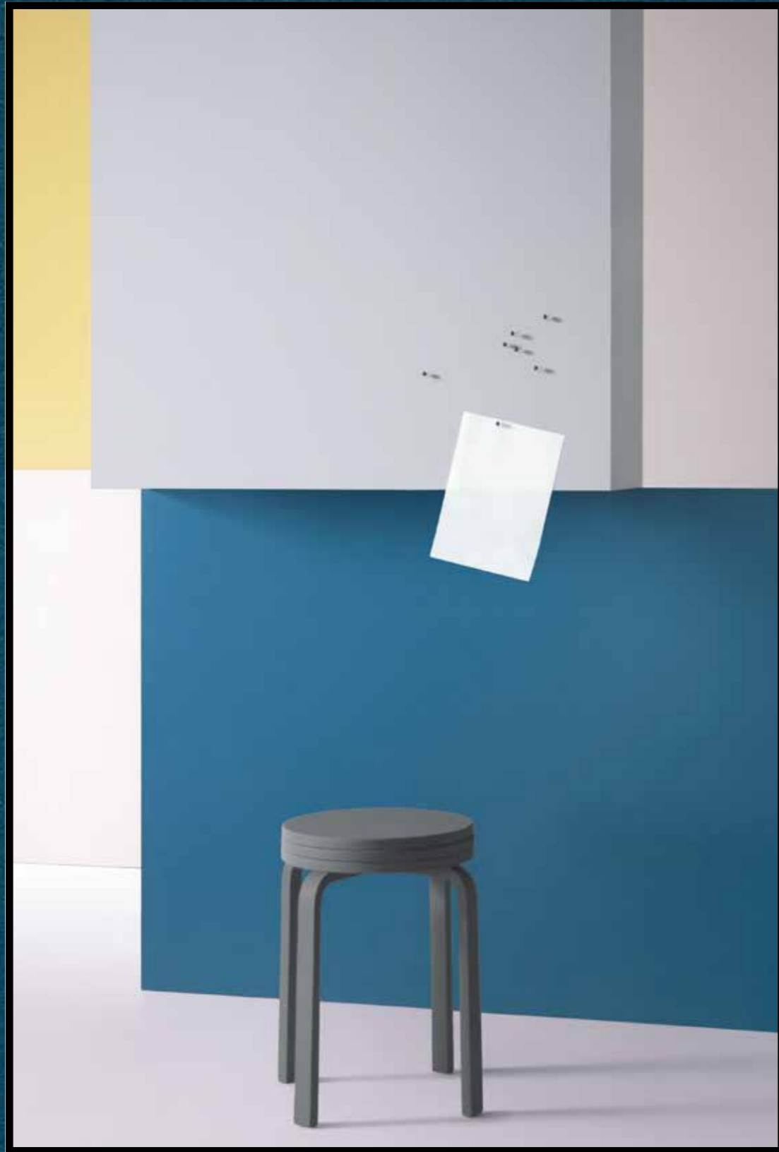
2162 | duck egg 2186 | blanded almond 2214 | blue berry 3363 | walton lilac